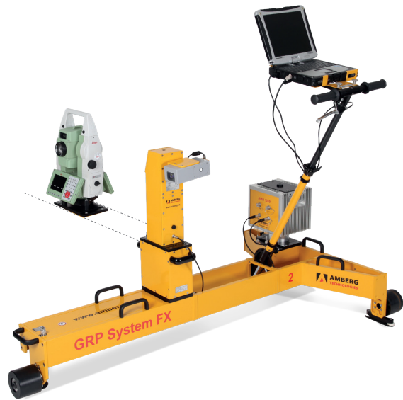
Front: Amberg IMS 3000 with Profiler 110 FX Back: Total station for Amberg IMS 1000